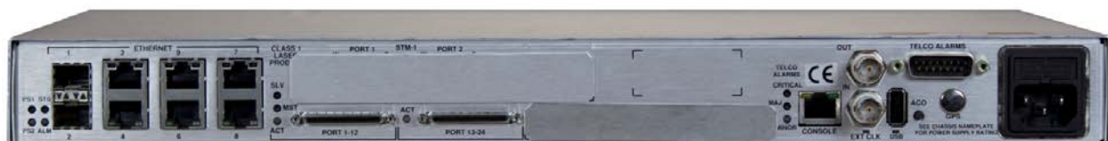
CXU-810-16E Back Panel